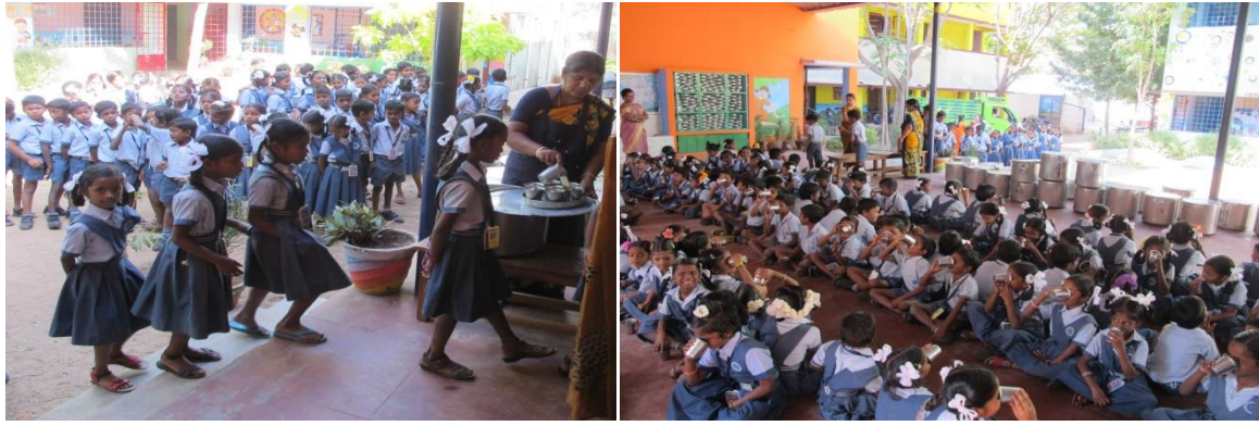
HAND WASH & NOON MEAL TAKEN BY CHILDREN IN SCHOOL